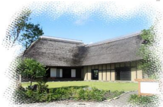
Nambu Magariya (Nambu Bent House): L Shaped farmhouse formed by integrating the main house and the horse barn.

Morioka Handi-Works Square, one of the leading industrial tourism facilities in Morioka, is located near Lake Gosho where you can enjoy the beauty of all four seasons. It takes about 30 minutes to reach the Square from the city center, heading west on Route46. At the workshop area, which has 15 studios of 11 business categories, you can see traditional skills of craftsmen up close. In addition to this, you can enjoy hands-on workshops of more than 10 different kinds of unique crafts and local dishes. In the Nambu Magariya , a kind of L-shaped farmhouse where people used to live in one wing with their horse(s) in the other, you will be able to experience history and understand how people in our region used to live in the Edo period. Now, we would like to introduce the hands-on experience of Iwate's unique crafts held in the various workshops in the facility.